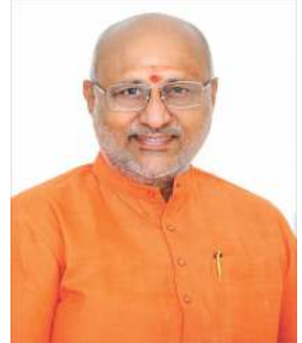
Shri C. P. Radhakrishnan

Shri Chandrapuram Ponnusami Radhakrishnan took charge as the Vice President of India on 12th of September, 2025. Born on 4th May, 1957 in Tiruppur, Tamil Nadu and with more than four decades of experience, Shri Radhakrishnan is a respected name in the polity and public life. He earned a Bachelor's Degree in Business Administration. He ran a successful stint as a garment exporter before entering public life. During his political career, he served as the Secretary of Bharatiya Janata Party, Tamil Nadu and was elected to the Lok Sabha for the first time in 1998 from the constituency of Coimbatore. As a Member of Parliament, he served as the Chairman of the Parliamentary Standing Committee for Textiles, a member of the Parliamentary Committee for Public Sector Undertakings and the Consultative Committee for Finance. Prior to being appointed the Vice President, he served as the Governor of Maharashtra for a little more than a year, the Governor of Jharkhand for nearly one and a half years. During this period, he also held additional charges as the Governor of Telangana and the Lt. Governor of Puducherry for brief periods. Apart from his life in politics and keen interest in improving higher education, Shri Radhakrishnan is an avid sportsman. A college champion in table tennis and long distance running, he also enjoys cricket and volleyball.