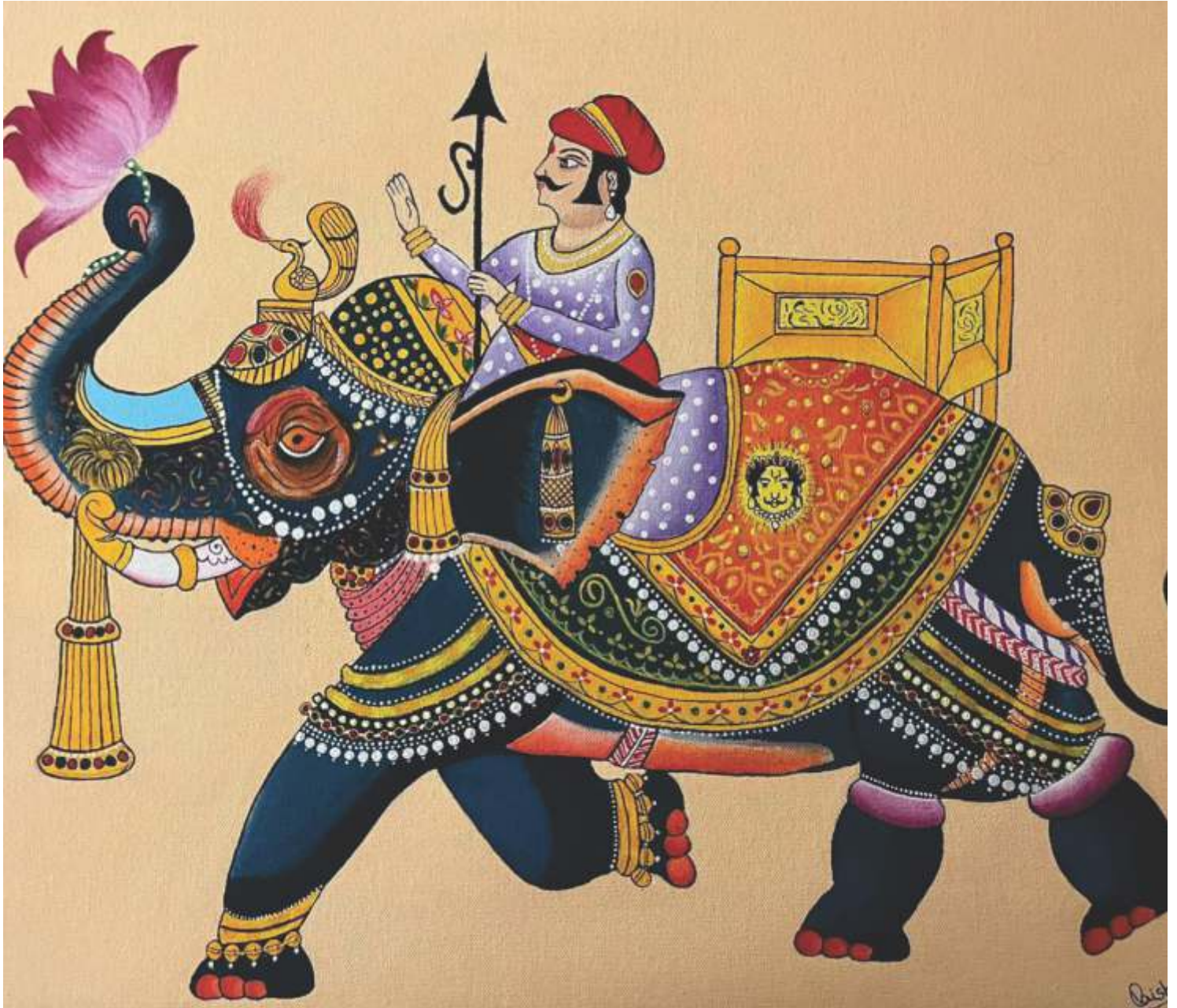
Vaishnavi P 12 Deneb 1