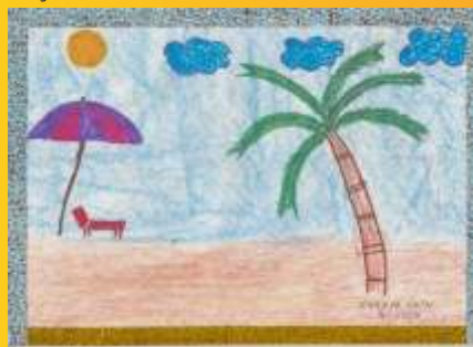
Shreya Nath Class 4 Vega