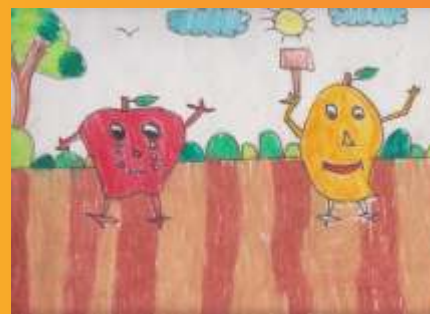
Ronak Singal Class 3 Deneb