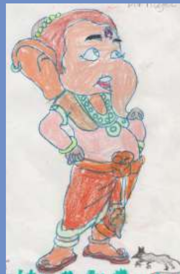
Rupesh More Class 1 Rigel