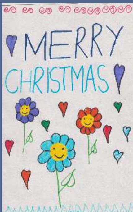
Siddhi Jaiswal Class 3 Sirius