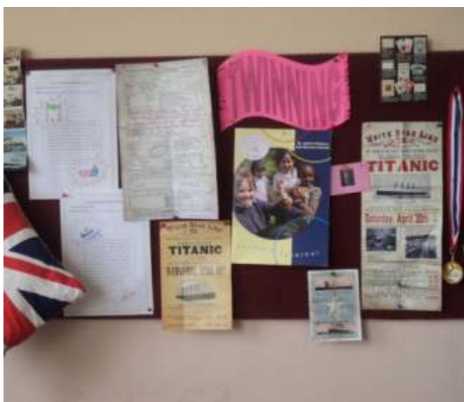
Momentos from St. Johns Primary and Nursery School, UK.

Our students had sent across some seeds of flowers as a sign of goodwill which we are sure shall find a place in the gardens at St. John's School, hence initiating a shared learning experience and emotional bond between the two sides. They in turn have sent us their art work, pictures and creative writings giving our students an insight into their culture and life.