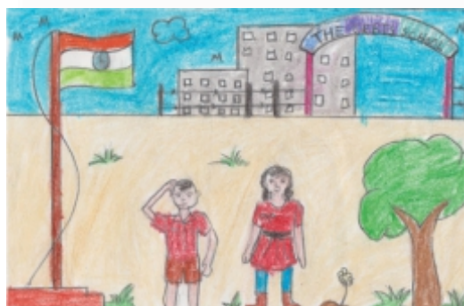
Jeet Ghegade, 3 Deneb