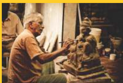
An artist at work, Margao, Goa

A collage making activity was conducted for the students of classes 4 – 6 to usher in the festive spirit of the 'Ganpati Utsav'. The students created beautiful collages using Eco-friendly materials like leaves and grains of different colours.