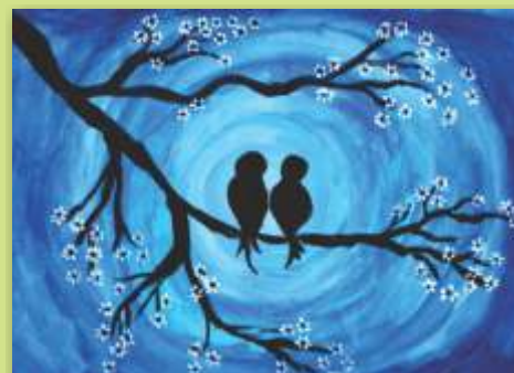
Akriti Vatal 6 Vega