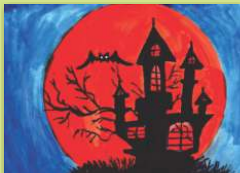
Akshat Vatal 6 Vega