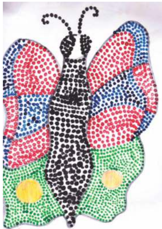
Harshita 4 Debneb