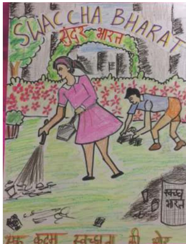
Rashmi Pai - Class - 6, Vega