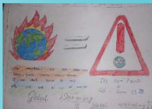
Fawzaan Shaikh - Class 8, Vega