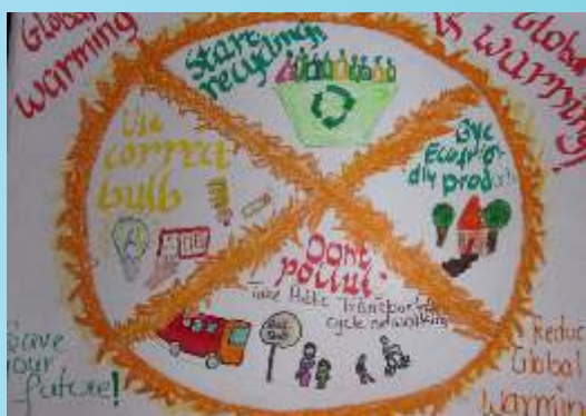
Medha Bhawsar - Class 8