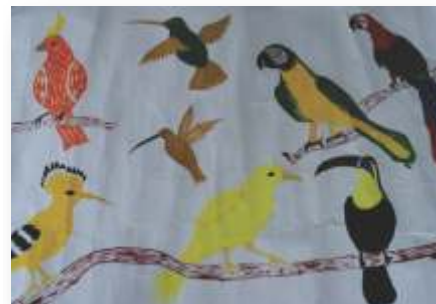
Levi Ebenezer Class 3 Vega