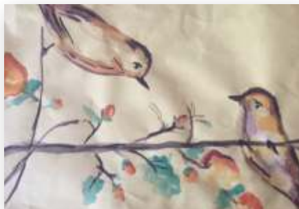
Kavana Ankalekar Class 7 Sirius