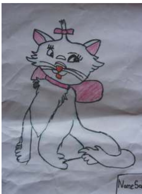
Sakshi B -Class 3 Vega