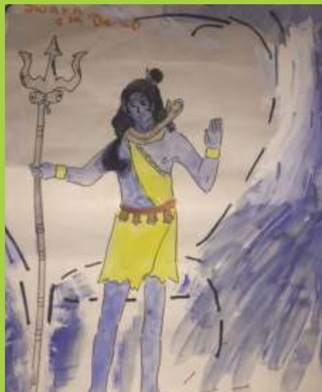
Swarn Patil Class 6 Deneb