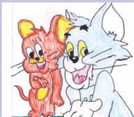
Charvi Pachauri Class 4 Sirius

International Olympiad examination was conducted for students of classes 1 to 5.