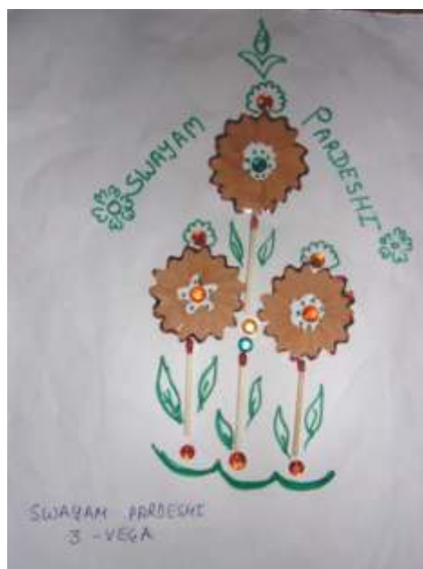
Swayam Pardeshi - Class 3 Vega

link - to view Students Article - http://epaper.sakaaltimes.com/SakaalTimes/index.htm