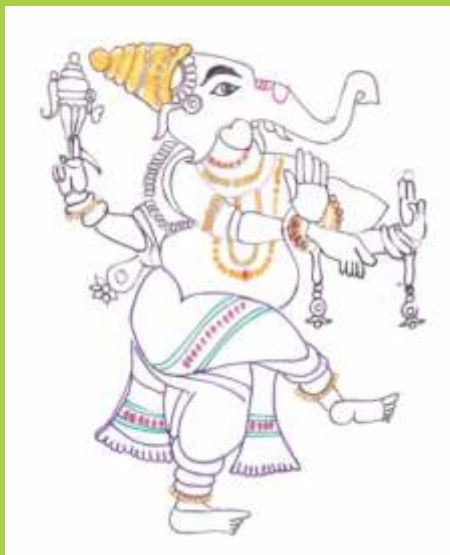
Prisha Loya Class 4 Deneb