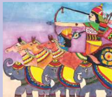
Mehek Doshi Class 6 Sirius