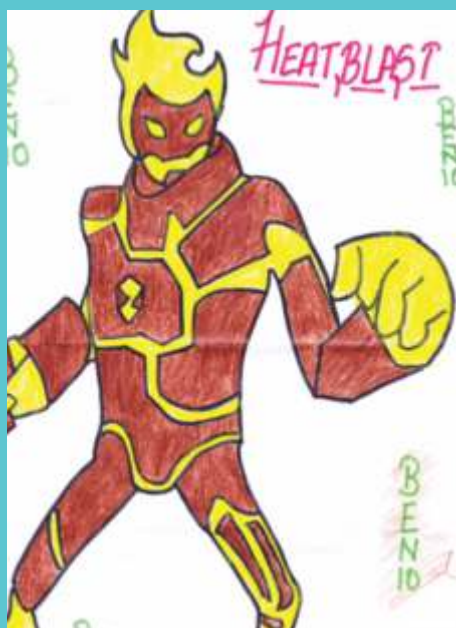
Samyak Jain Class 6 Vega