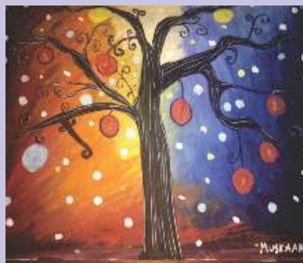
Muskaan A Class 6 Sirius