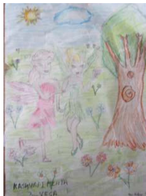
Kashyapi Mehta - Class 3 Vega