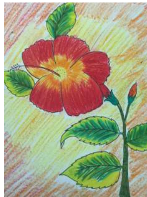
Anusha Iyer class 7 Sirius