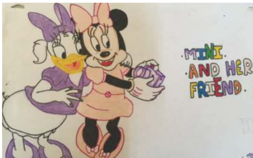
Shital Rampure class 6 Deneb