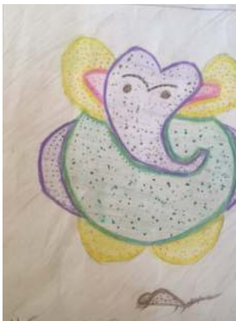
Nevil Gohil 2 Polaris