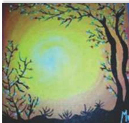
Mahi Jawle, Std IV, The Orbis School

Link - to view Students Article - http://epaper.sakaaltimes.com/SakaalTimes/index.htm