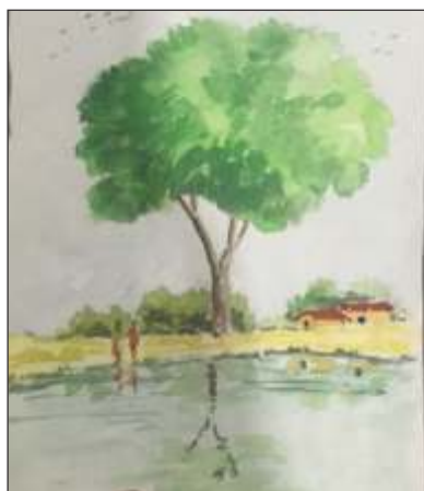
Ishika Gupta 6 Sirius