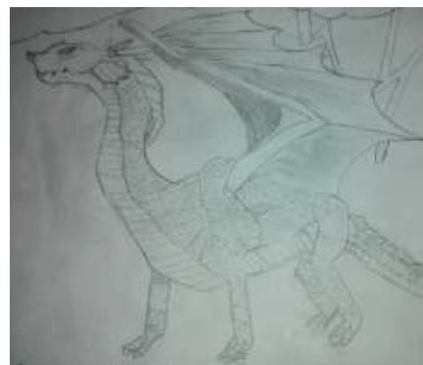
Piyush Rangdal Class 6 S