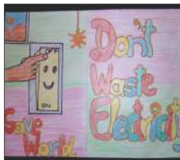
Ayush Nagar 6 Vega