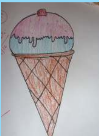
Samyak Raut 1 Vega