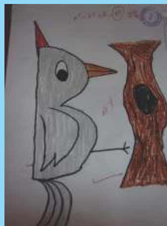
Devasmita 3 Vega