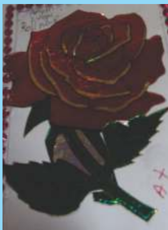
Aryan 2 Vega