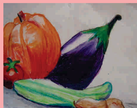
Tanmayee 3 (Vega)