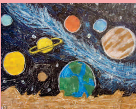
Shilpi 3 (Vega)