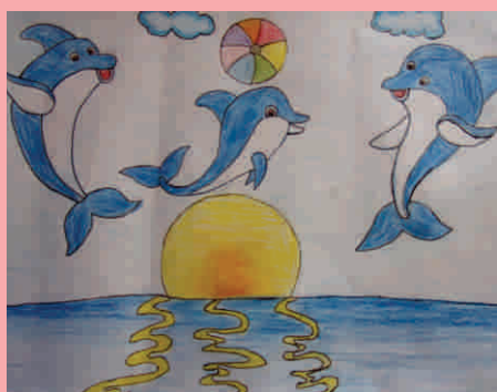
Shilpi 3 (Vega)