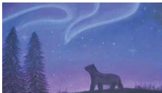
Arinjay Nair - 9 Vega - TOS 2