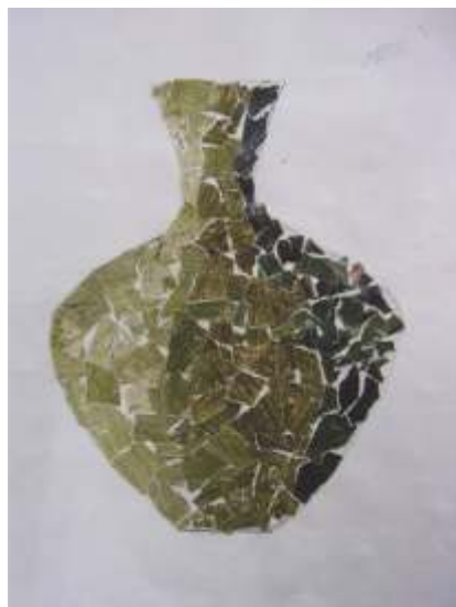
Sanskriti Dhoot - 8 Vega - TOS 2