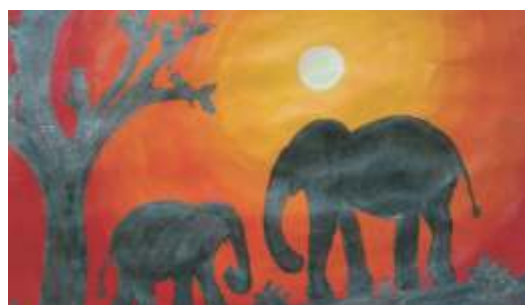
Ananth Syam - 5 Deneb - TOS 1