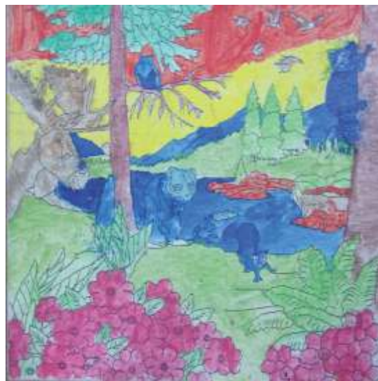
Ashita Lad - 3 Sirius - TOS 2