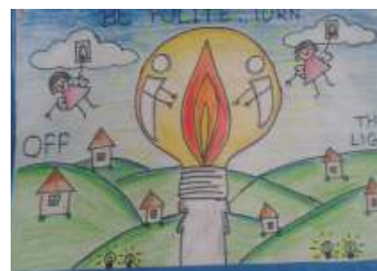
Yash Mandaliya - TOS 1