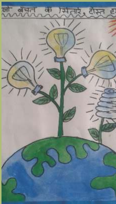
Ishika More 4 Deneb - TOS 1