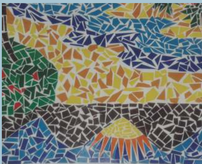
Karishni 6 Rigel - TOS 1