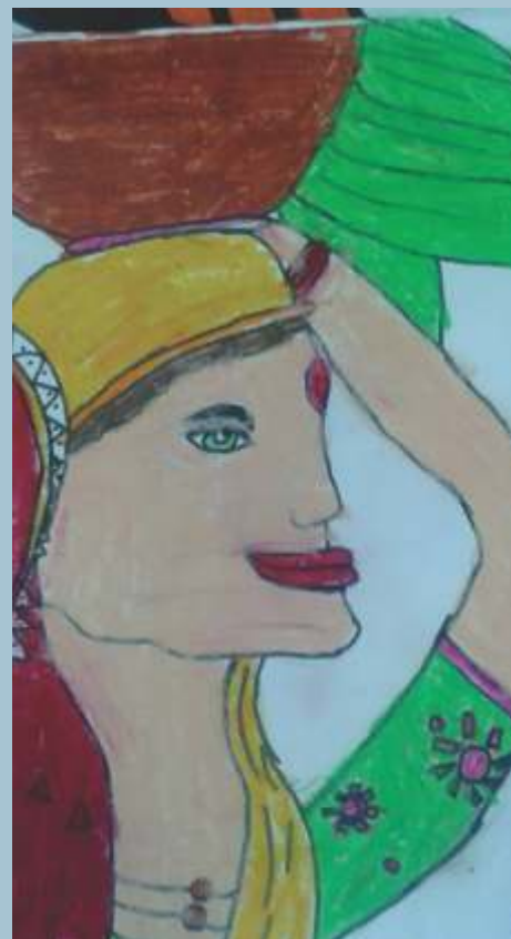
Daya 2 Sirius - TOS 1