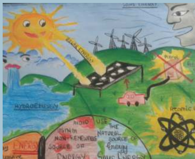
Palak Sanghvi 7 Vega - TOS 1