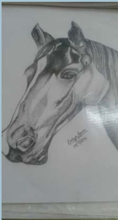
Amlyn Fynn 8 Vega - TOS1