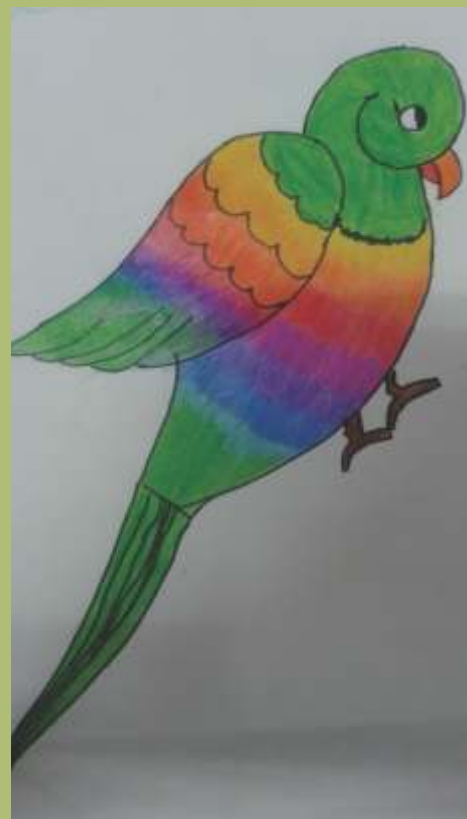
Jhanvi 2 Sirius - TOS 1