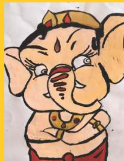
Diya Agarwal - 5vega- Tos 2