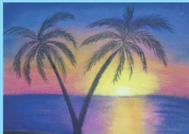
Arinjay Nair - 9 Vega - Tos2