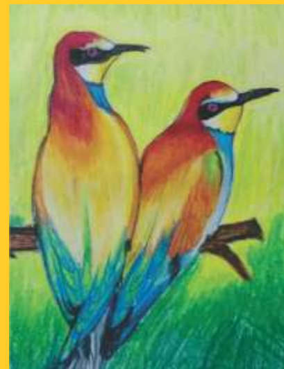
Manish Patil - 7 Vega - Tos 2