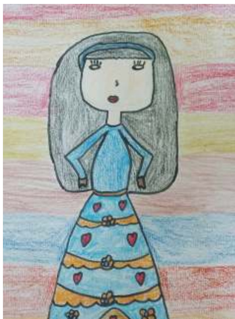
Deboshmita Mandal - 2 A