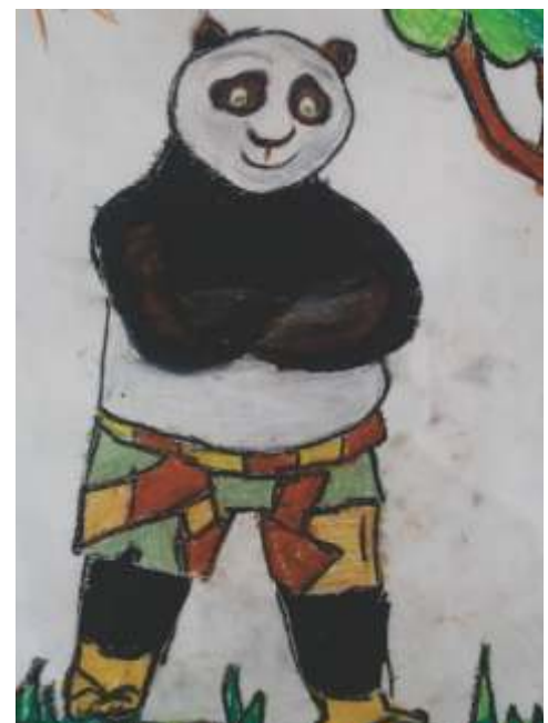
Avanish Bisht - 2 V