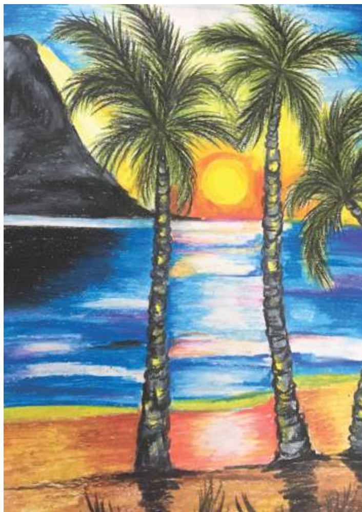
Manish Patil - 8 Vega