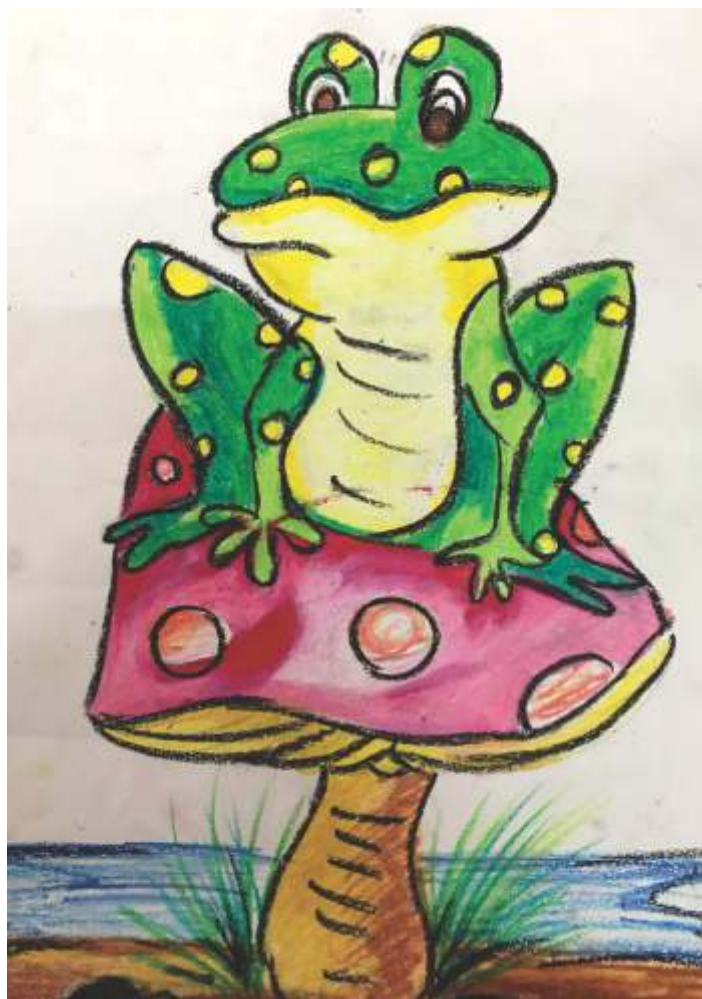
Samyak - 4 Sirius