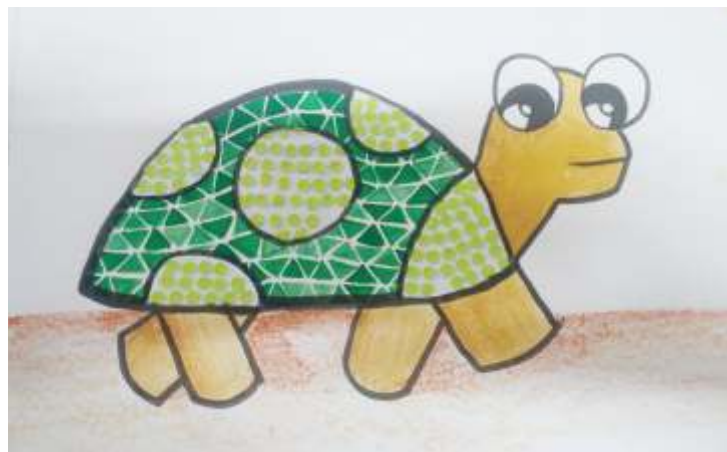
Karunya Ankleskar, 5V