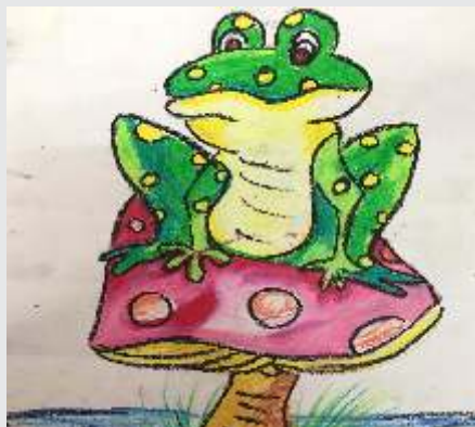
Samyak, 4 Sirius - TOS2