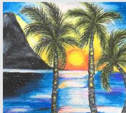
Manish Patil, 8 Vega - TOS 2