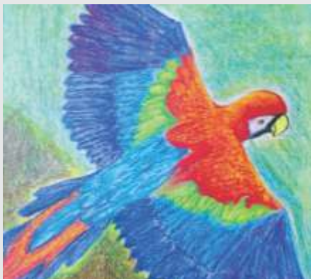
Manish Patil, 8 Vega - TOS 2