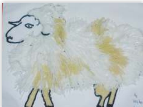
Keshav Daga, Class 5