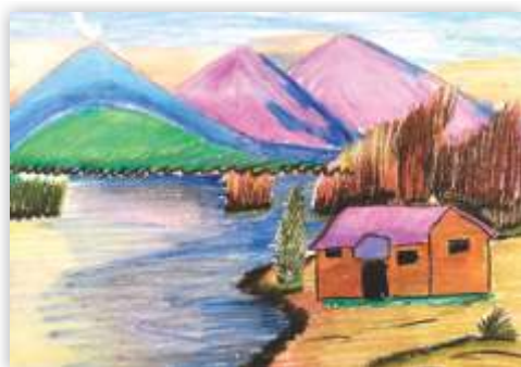
Gauri Agarwal - 5 Siruis (TOS2)