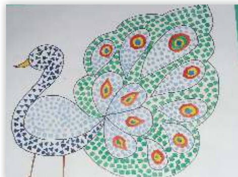
Stuti Chintan, Class 6