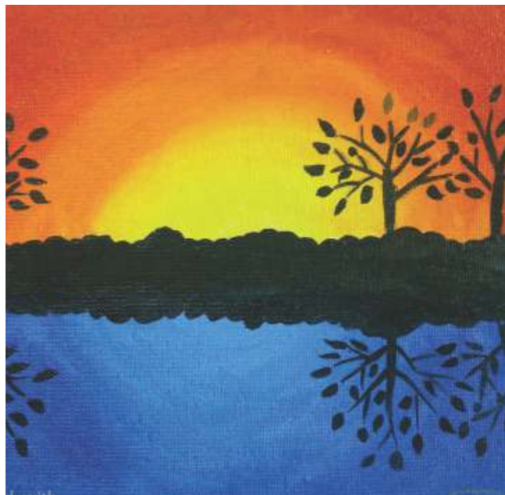
Pinki Pal - 5V