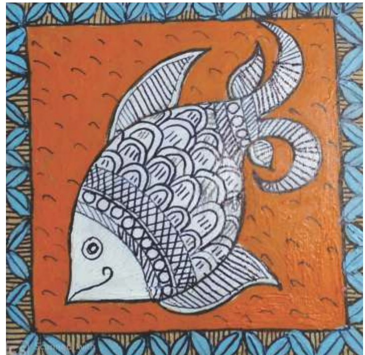
Kirtika T - 6D