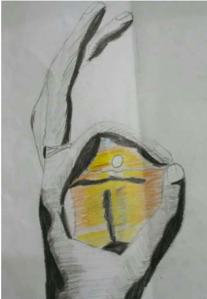
Anushka K 4 D