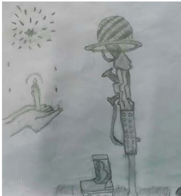
Varun.S - 5D