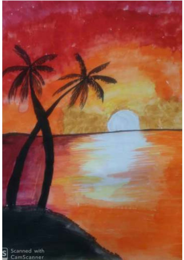
Darsh Pathak - 5V