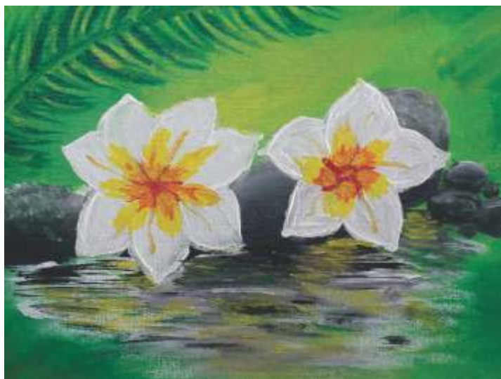
Pinki Pal - 5V