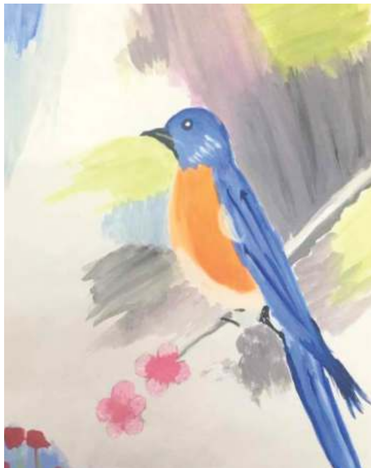
Dnyaneshwari - 7 V