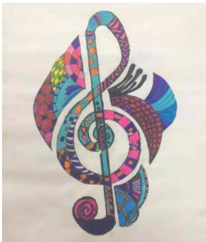
Diya Agarwal - 7 V