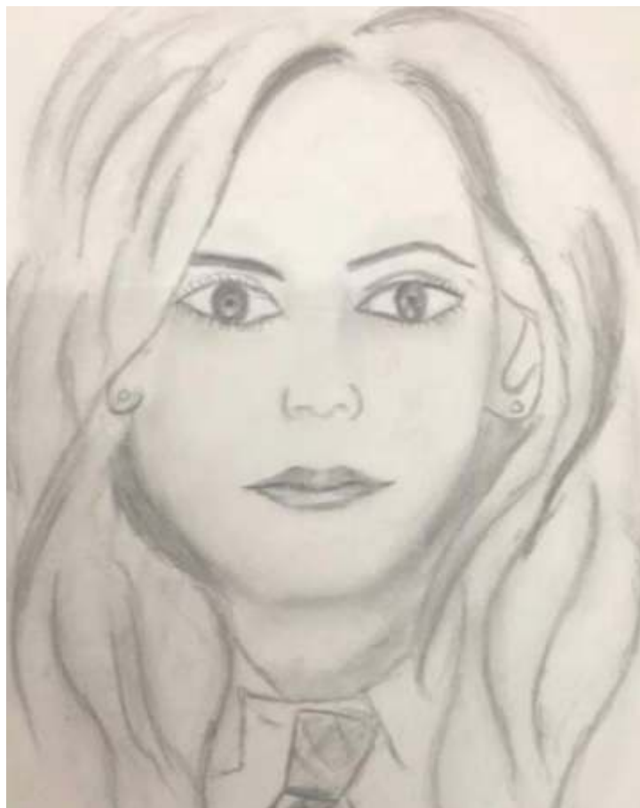
Dnyaneshwari - 7 V