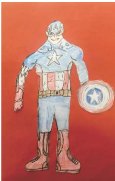
Joshua Koshy - 7 V