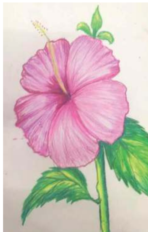
Hamsika - 7 V