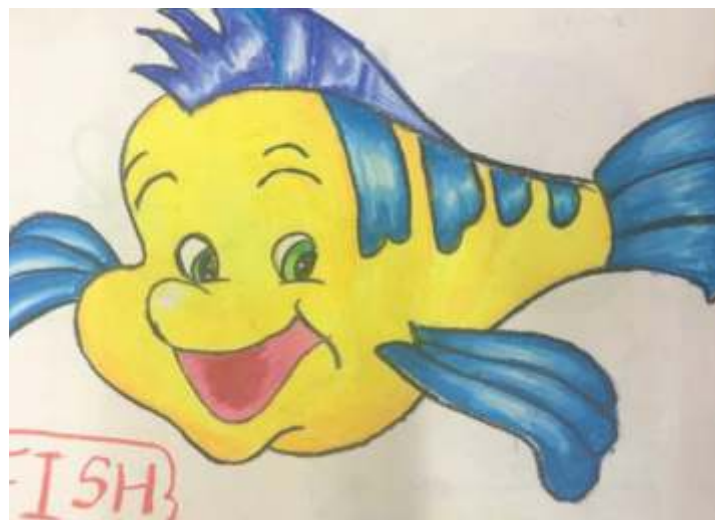
Hamsika - 7 V