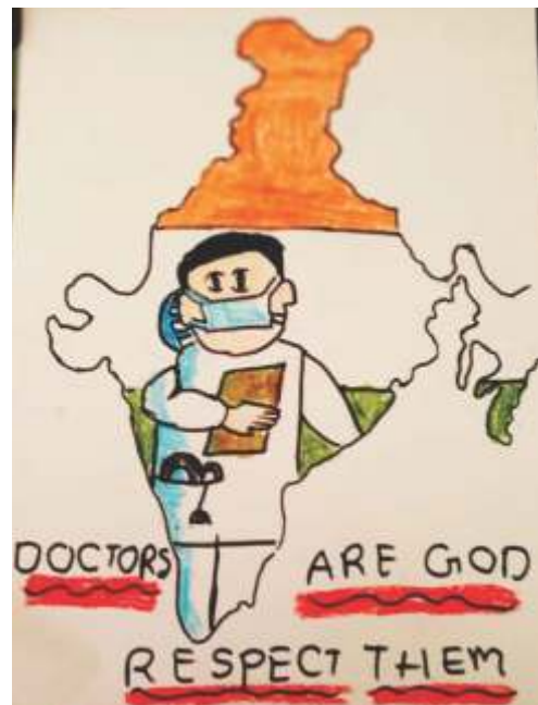
Sparsho - 6 S