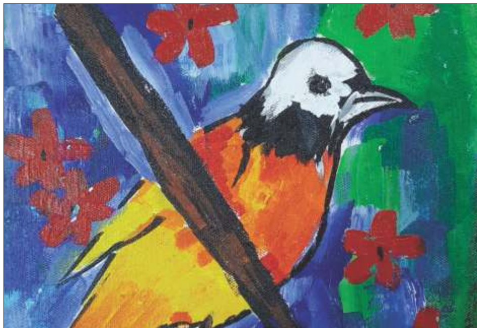
Soumya - 7 Sirius