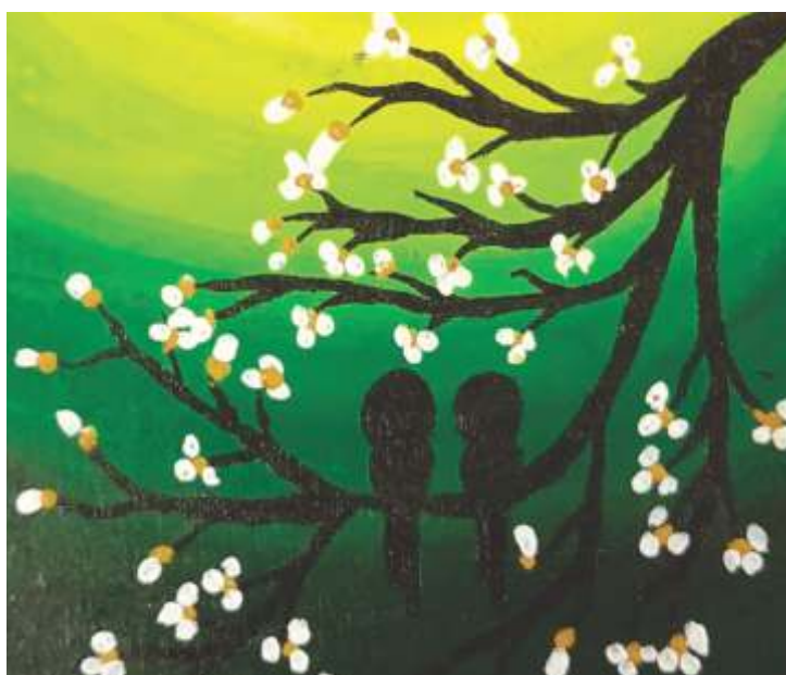
Dnyaneshwari K - 8 Vega