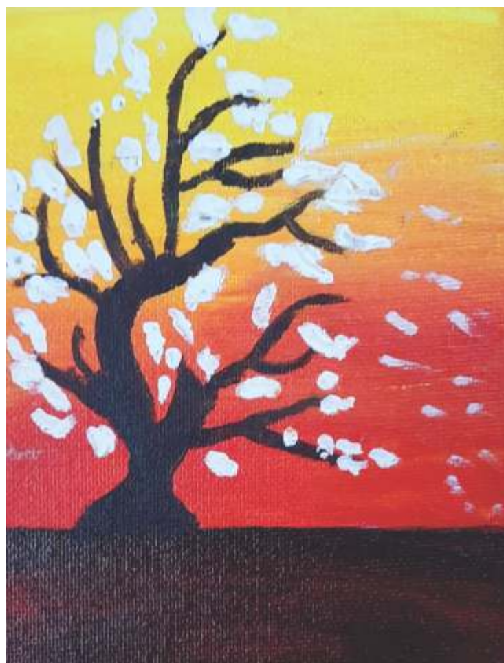
Dnyaneshwari K - 8 Vega