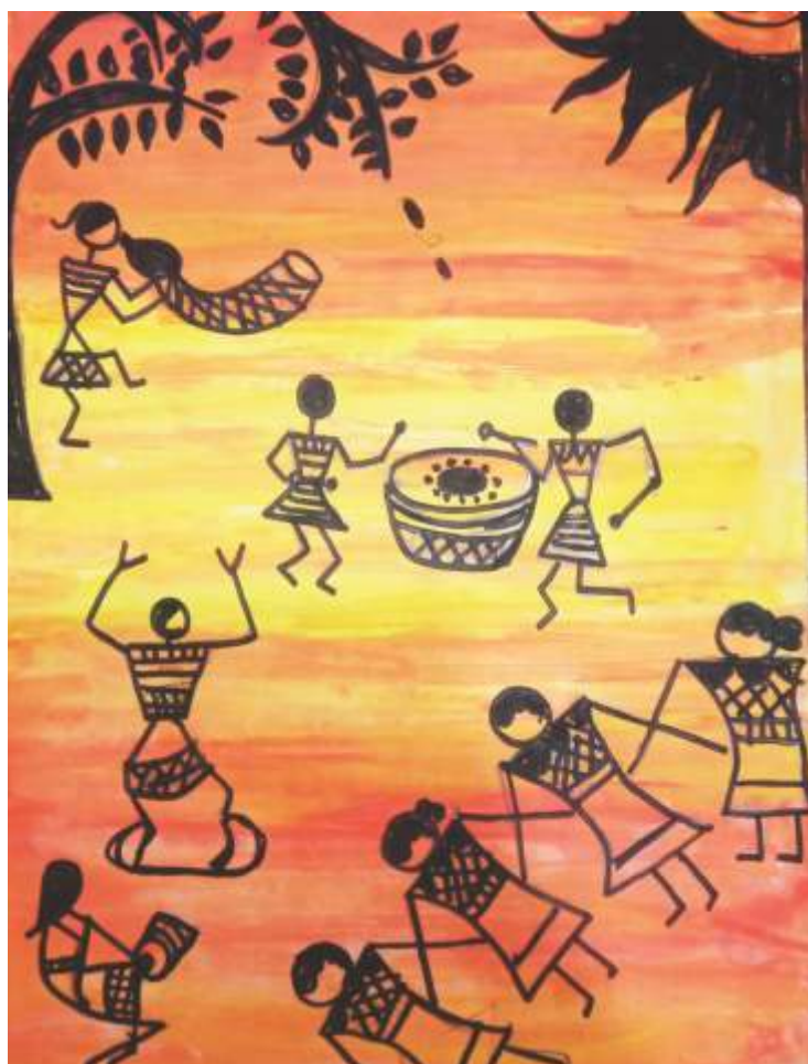
Sparsho - 6 S