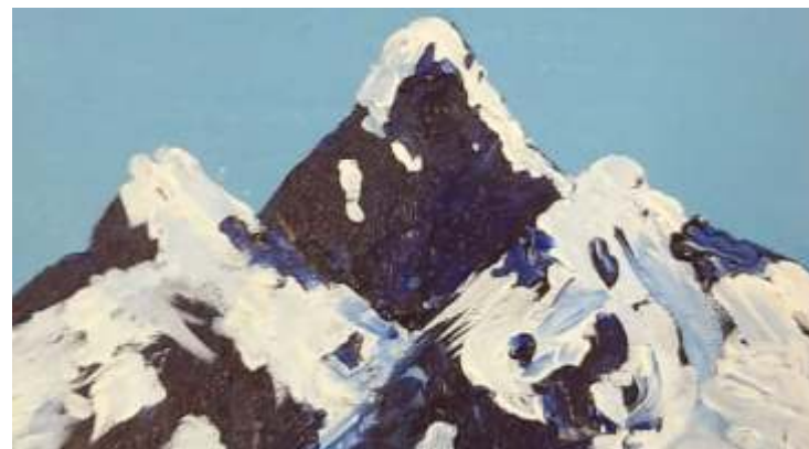
Dnyaneshwari K - 8 Vega