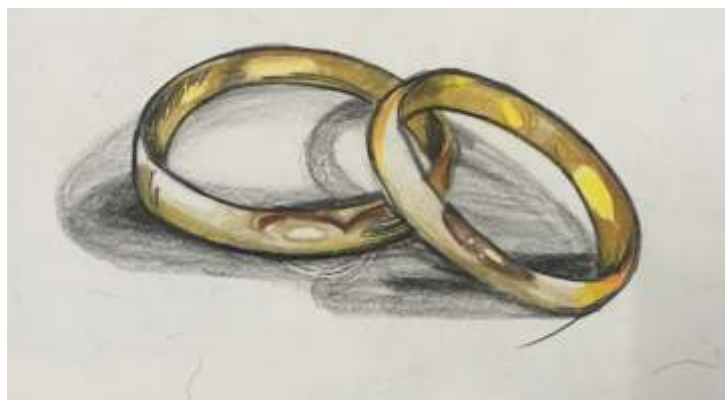
Anvi Pandey - 5V