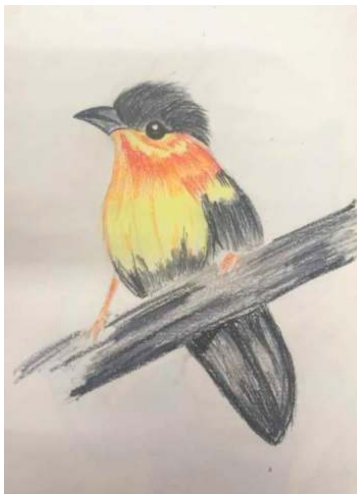
Hamsika - 7 V