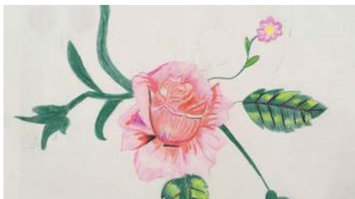
Ananya Soni - 5V