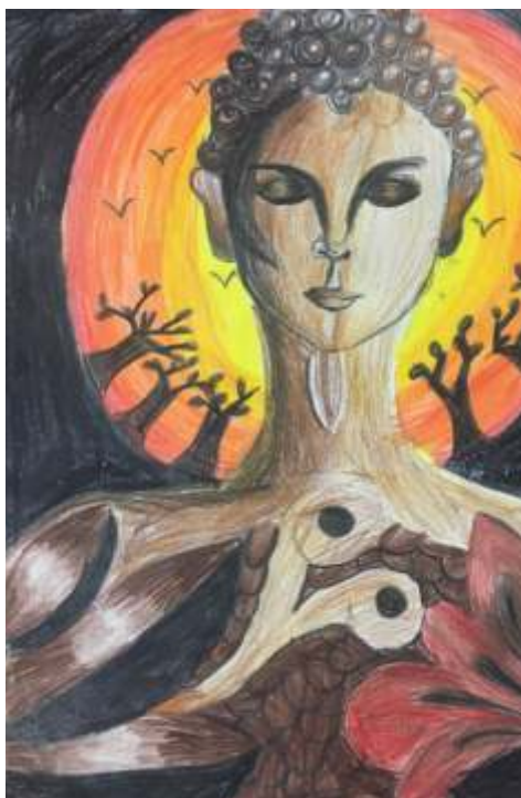
Anvi Pandey - 5V