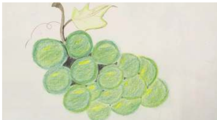
Ananya Soni - 5V