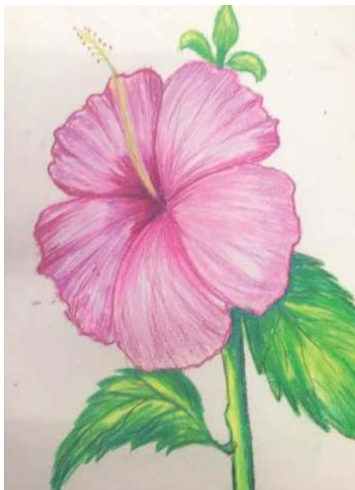
Hamsika - 7 V