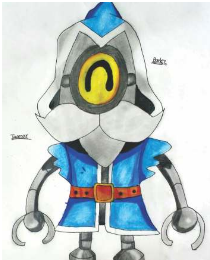
Tanmay Ambode 5 Sirius

Based on your reading about the personality of the month try to answer these interesting questions: