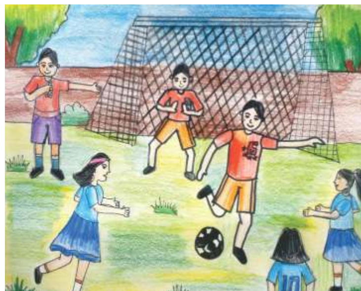
Lakshita Pattnaik 5 Sirius