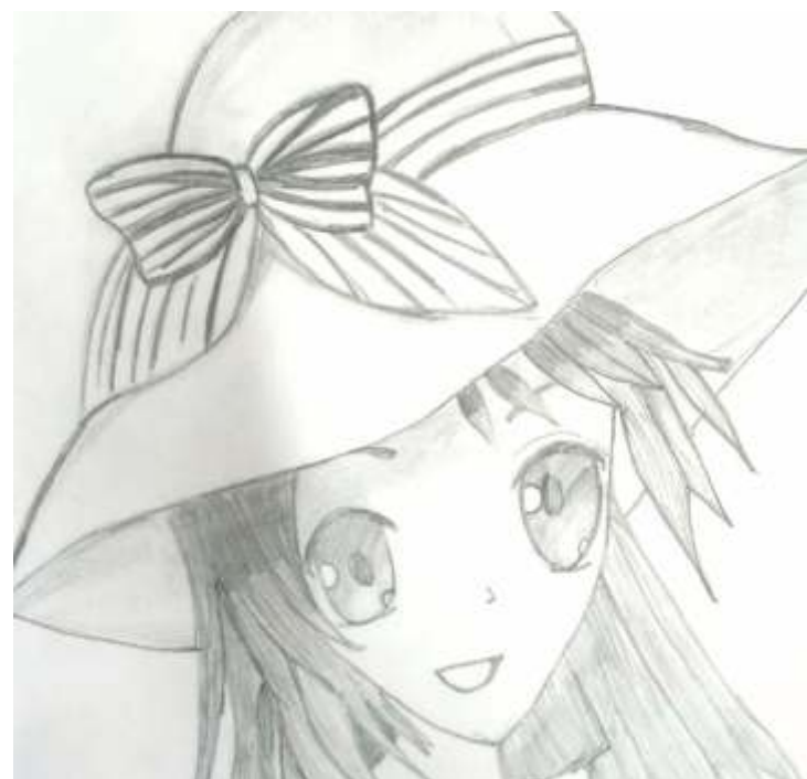
Diya Vettathu 5 Deneb