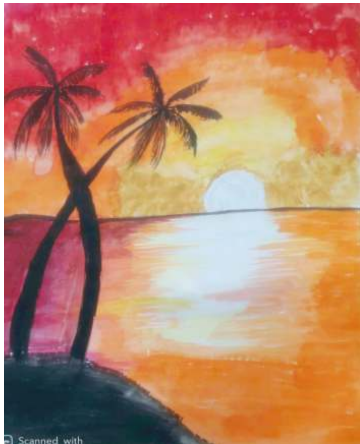
Darsh Pathak - 5V