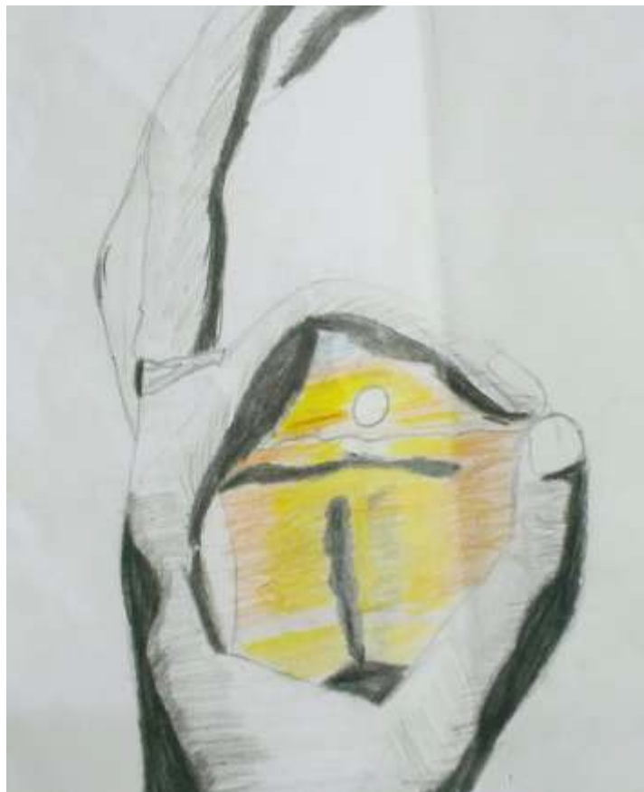
Anushka K - .4D