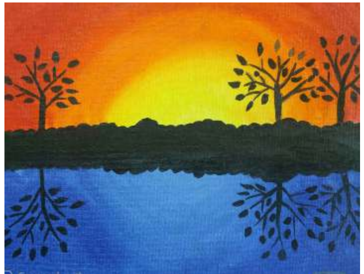
Pinki Pal - 5V