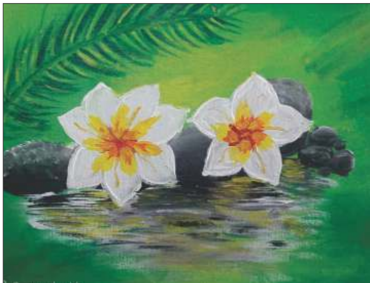
Pinki Pal - 5V