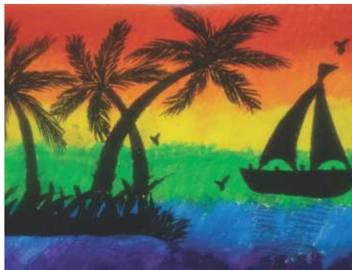
Pinki Pal - 5V