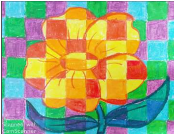
Lakshita.P - 5S